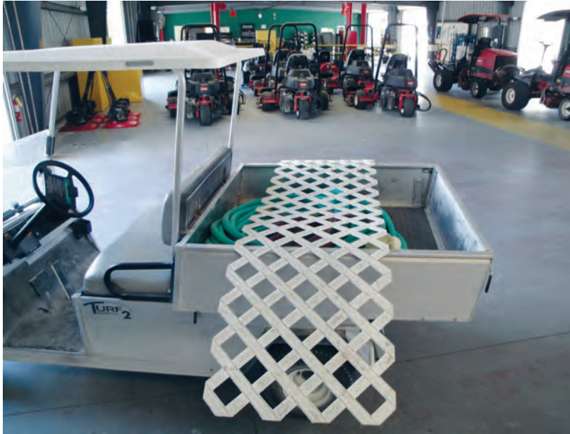
Plastic lattice sheets are lightweight and easy to transport.

At Calusa Pines, due to a very low height of cut and frequency of mowing and rolling, the edges and collars